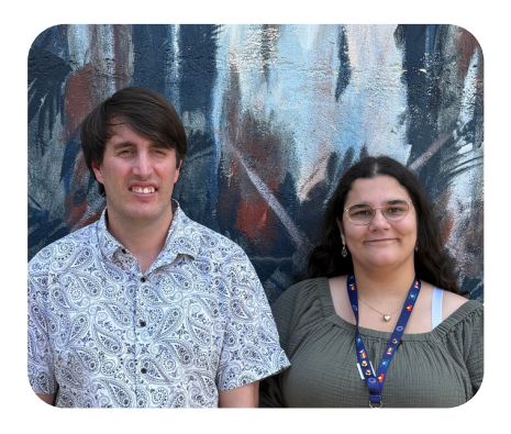
Key partners in the project include Gippsland Disability Advocacy Incorporated , Federation University , and the Department of Social Services .

We are an education and advocacy team who facilitate educational programs and community events through collaboration with people with cognitive disabilities in all aspects of our work. By placing people with cognitive disabilities at the centre of our work, we work together to discuss, share, and learn about Respect, Rights and Relationships, building confidence and empowerment.