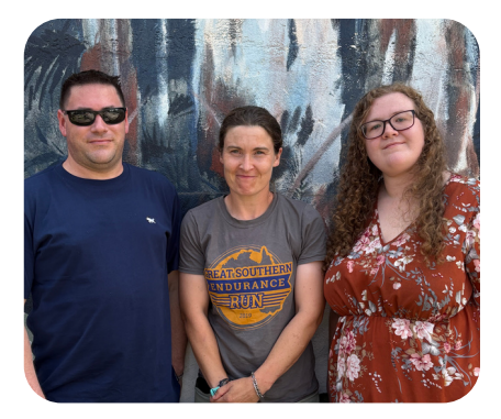
Together with 15 years of experience, we work to help people with cognitive disabilities learn about respect, rights and safe relationships.